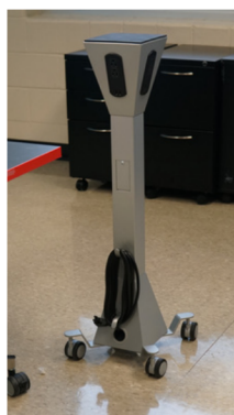
Above: All new classroom furniture at Kirk and Shaw have wheels to allow for greater flexibility in classroom work. Right: New mobile charging stations will allow students and staff to work without looking for a nearby outlet.