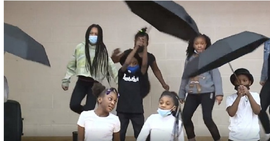
Above: Students performing at SSFA Winter Showcase

The show offered selections themed to the four seasons, like third grade students performing a dance compilation to the songs “Singing in the Rain” and “Under My Umbrella” to represent the spring season. “All of our students perform in the showcase in some capacity,” said building principal Monique Ceasor. “Exploring the arts is part of the student’s daily experience.”